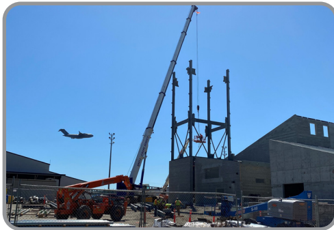
SOF 22 STS's parachute drying tower.

From Intern John DeWulf at the Real World Academy project: Construction is starting to heat up out at the Real World Academy project with Absher Self Perform completing the first concrete pour for the foundations in the gym/locker room area. Crews have been working in sequence to get the north and west foundation areas ready for concrete pours with North Central Construction excavating and Absher Self Perform putting up the formwork. Huber Brothers is following close behind installing the rebar. Once the footings are poured, the stem walls will follow close behind. Our electrical and mechanical subcontractors, Triumph Electric and Apollo Mechanical are busy in the west building area, installing the deep underground electrical and plumbing. In the coming weeks Ken Spilker Masonry will begin on the structural CMU walls in the gym/locker room area. Phase II site work has