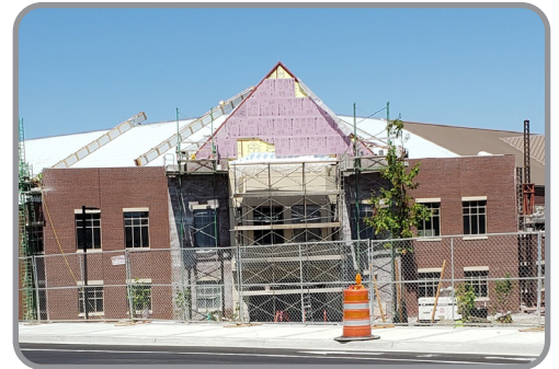
Auburn ES 16 progress.

From Intern Blake Nelson at SOF 22 STS: Construction is making continued progress on site utilities, slabs, and CMU and concrete walls for the SOF 22 STS Jabez-Absher joint-venture project. Ceccanti, Inc has completed compaction and grading of the North Access Road and is continuing backfill within Area A in preparation for our next slab-on-grade placement at the end of June. Blythe Mechanical has completed their installation of below grade sanitary sewer within the building footprint and turned their focus, along with all other MEPF trades, to the CMU Block walls. Keystone Masonry has finished CMU Block walls in Areas A/B, and have begun placing walls in Area C while our QC team conducts review/buyoff of Areas A/B. PSW Electric, Inc. is continuing the process of electrical and fire alarm rough-in alongside the mason, and proceeding with below grade rough-in for Area E. Caliber has placed all curbing/gutter along the North Access Road and in front of existing Building 304 which has allowed Lakeside Paving to begin laying asphalt for these areas. Corona Steel is using a crane on site to erect steel in Area A/B. DL Hendrickson has completed the installation of trusses above the armory which has allowed MEPF subcontractors to start in this area.