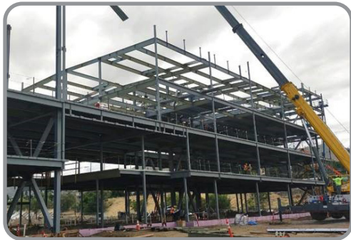
Building A progress at Chelan PUD.